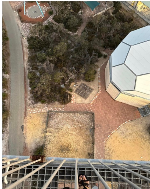
The Drop Zone

We started the Observatory tour with a presentation by Mitch who explained a lot about the sky, planets and stars and showed us on the screen what we were likely to see that night through the telescopes.