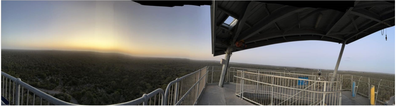
Panoramic View from top

On Sat 4 Nov we did a night tour of the Gingin Gravity Discovery Centre and Observatory. Some of us climbed the gravity tower and dropped our balloons one with a little water and one with more water to see which would hit the ground first, as per Galileo they both hit the ground at the same time when dropped at the same time!