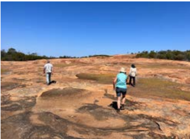
We refuelled and restocked our supplies and headed to Burra Rocks where we camped for the night.