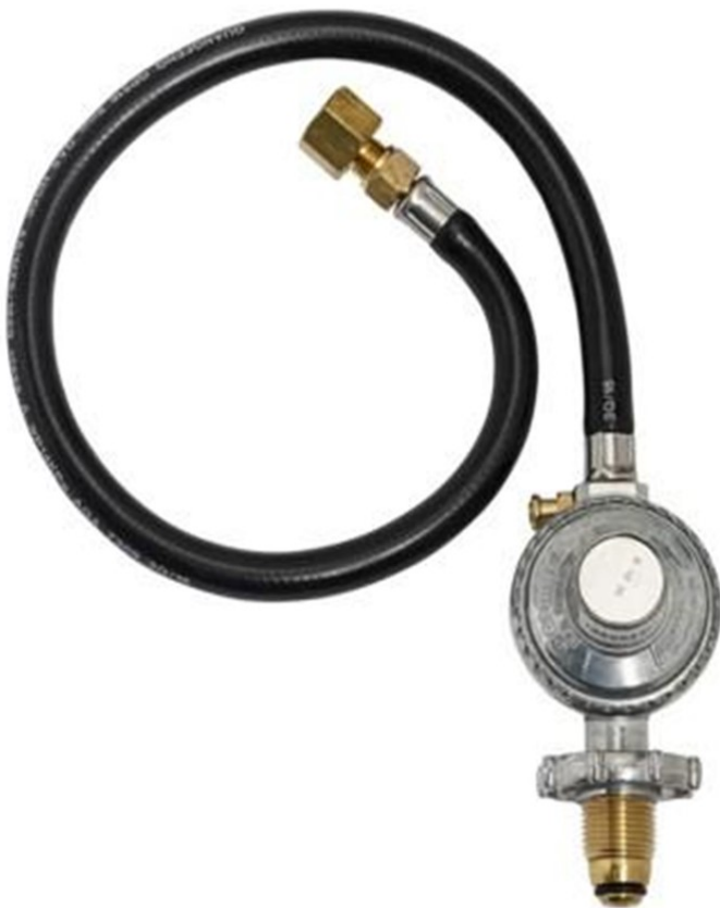
Current Type 21 LPG appliance connection