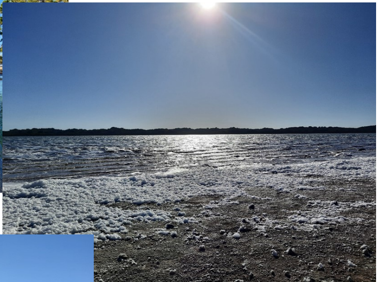
Above: Lake Preston with lots of foam happening (located behind the campsite)