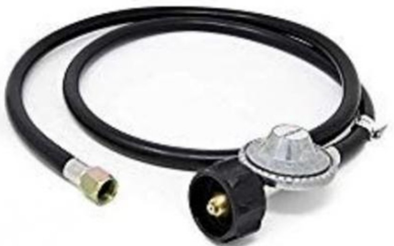
New Type 27 LPG appliance connection