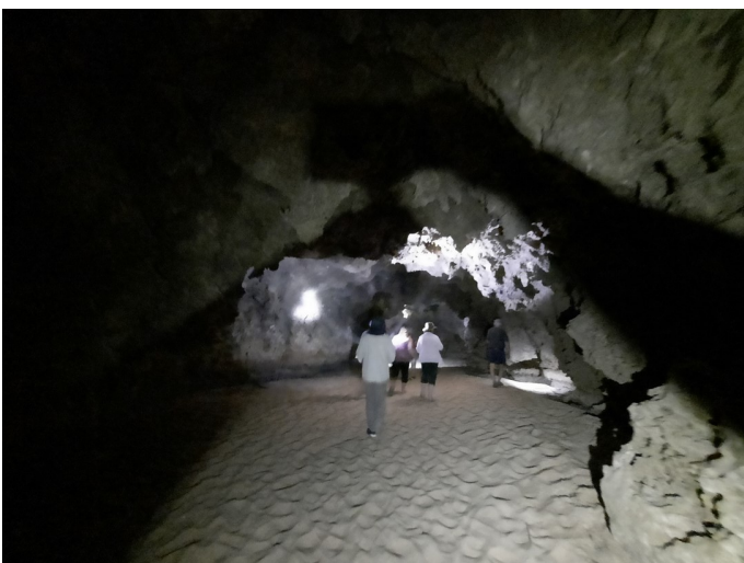
Stockyard Gully Cave (2)