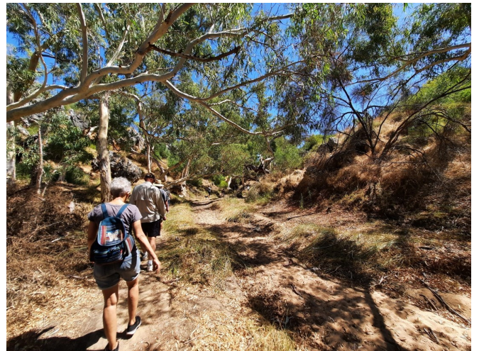
Stockyard Gully Cave (1)