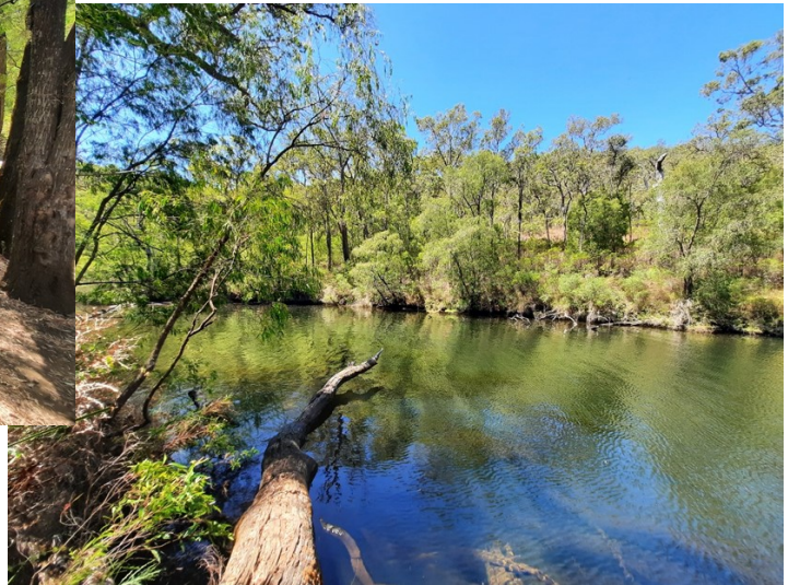
: Our lunch stop and swimming hole (Lennard Track)

There was a nice little hill at the end of the track which was interesting but we all successfully made it to the top. We then stopped at Fairyville (for those of you that know it, that were on the Collie Trip) to air up the tyres, but unfortunately all the displays have been destroyed by some inconsiderate people (that's being nice)