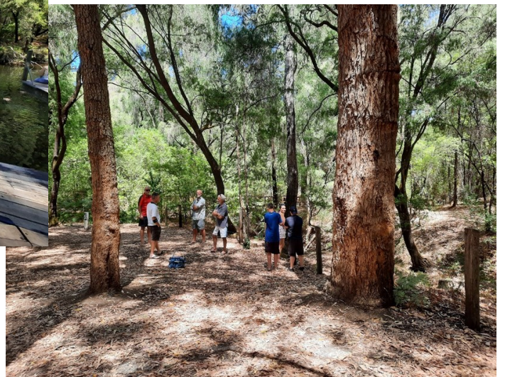
: Our lunch stop and swimming hole (Lennard Track)