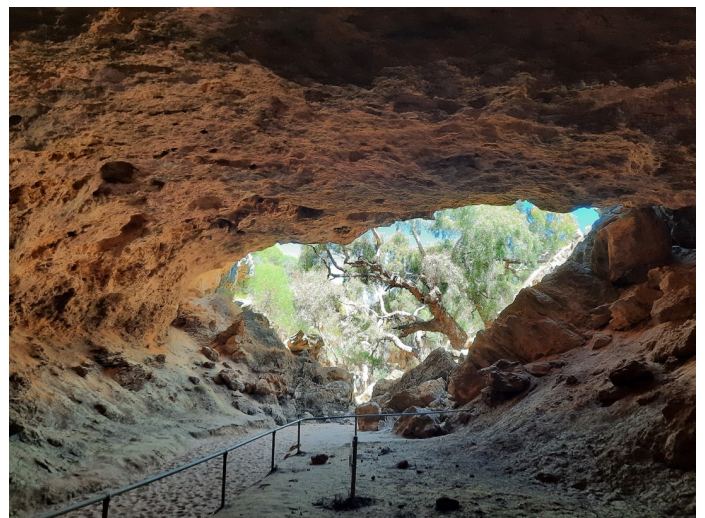
Stockyard Gully Cave (3)