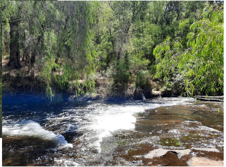
Above: Lennard Track

Track was a bit challenging in some parts and a bit bumpy, but overall a great and easy track. Stopped at a nice little rapid – water was beautiful and cool (a few of us just dabbled our feet in), and then a nice spot for lunch and a lovely swim. This was the spot that the club used to look after a number of years ago. Water was freezing but warmed up after a while. Took a walking track through the bush to a small waterfall.