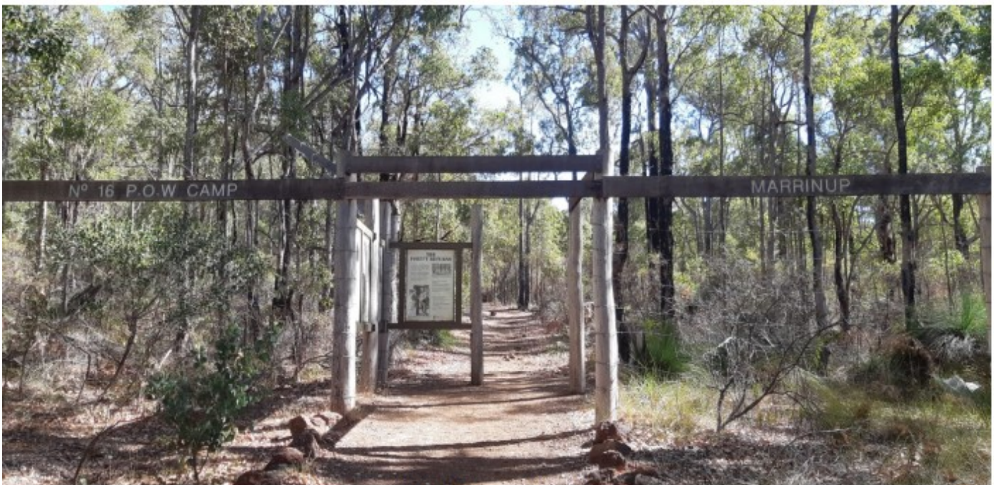
Marrinup POW Camp Entrance