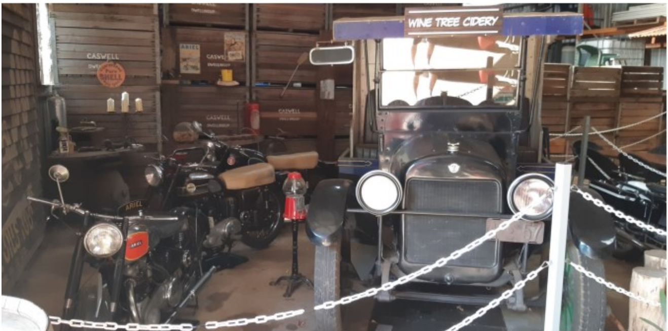
The Wine Tree Cidery Dwellingup (vintage vehicle display)