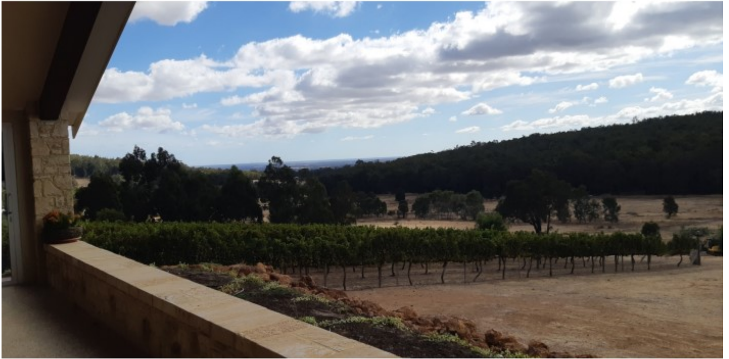
Redgum Wine Estate Dwellingup