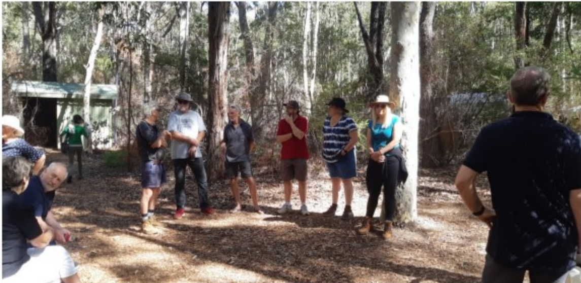
Some of the group