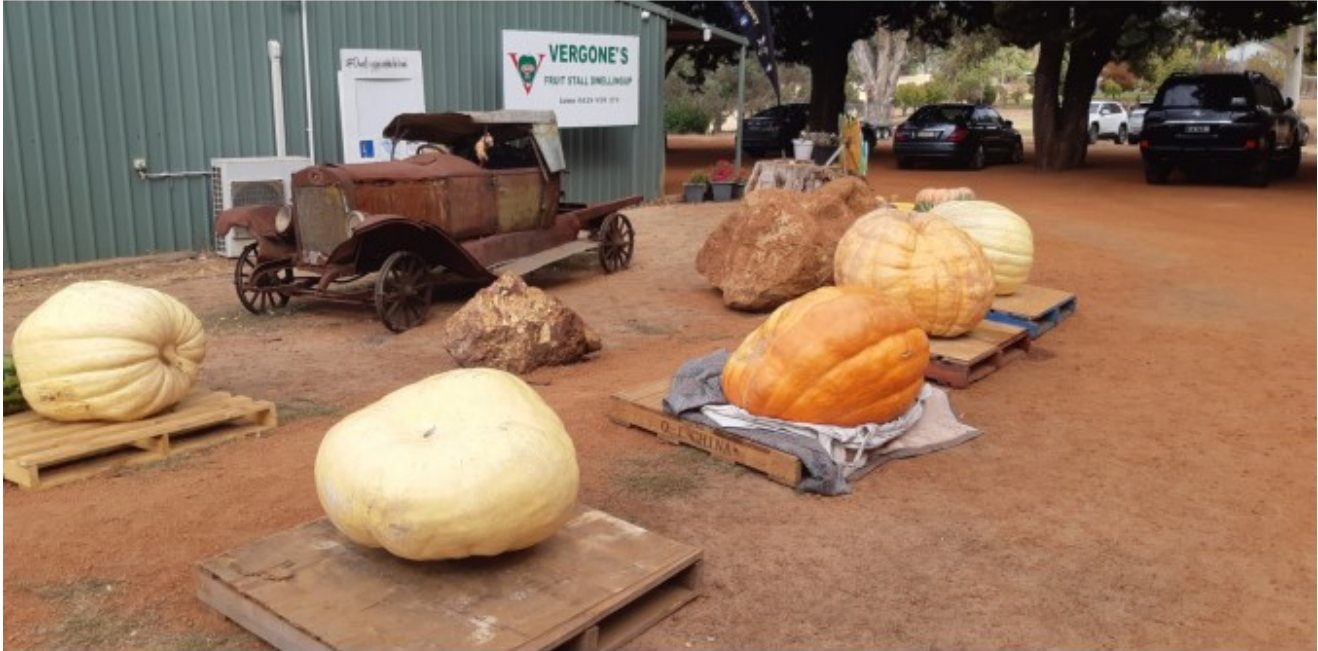
Vegone Farm Dwellingup (120kg Pumpkins on display)

Sat 27 th We had a free day with everyone choosing their own activities or just relaxing around camp. Steve and Kerry lunched their kayaks at Pinjarra for a paddle on the river and some of us crossed paths at Vegone's Farm Shop, The Wine Tree Cidery, Redgum Wine Estate and Scarp Pool.