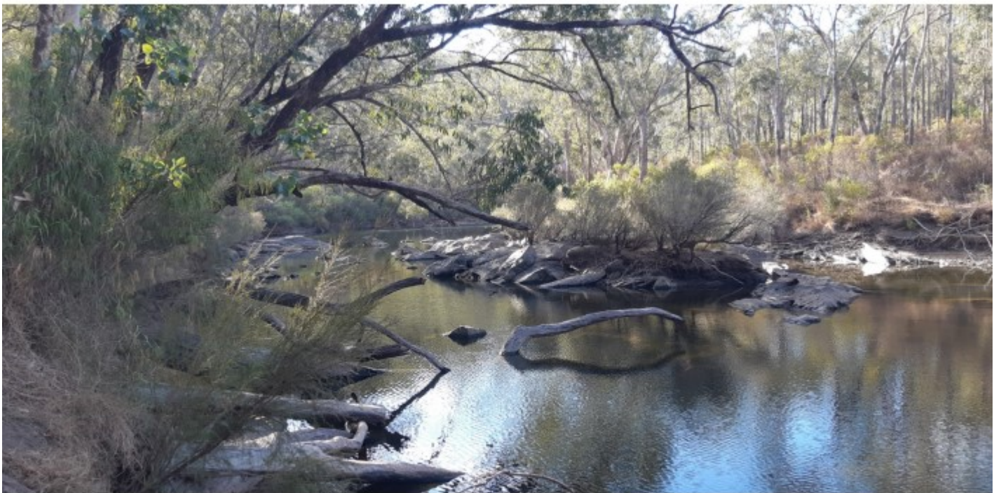
Scarp Pool - on the Murray River