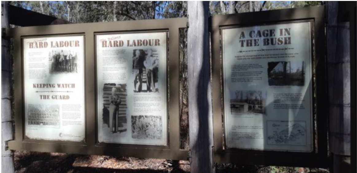
POW Camp information & history boards